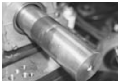
Typical fretting corrosion and shaft damage with setscrew bearing. Bearing quite often is "frozen" to shaft