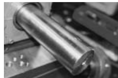
No fretting corrosion or shaft damage with the GRIP TIGHT Adapter ball bearing. Bearing is easily removed from shaft.